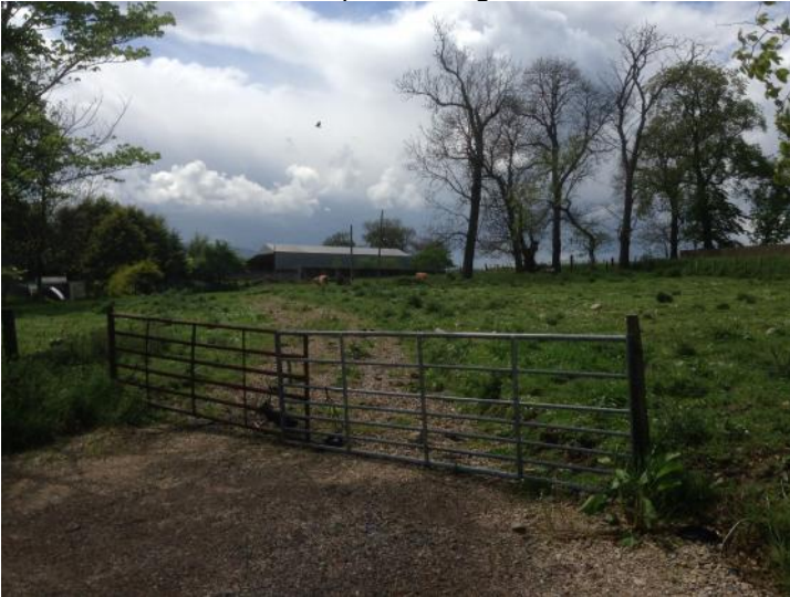
View of plot entrance