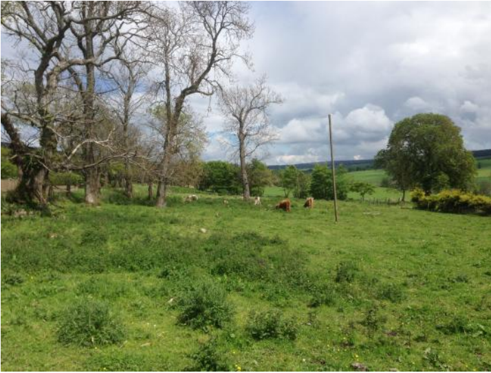
View of plot looking east