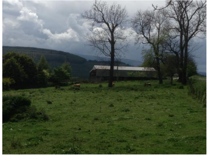
View of plot looking west